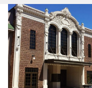
Fourth Street Moberly Theater