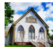
The Lyceum at Arrow Rock