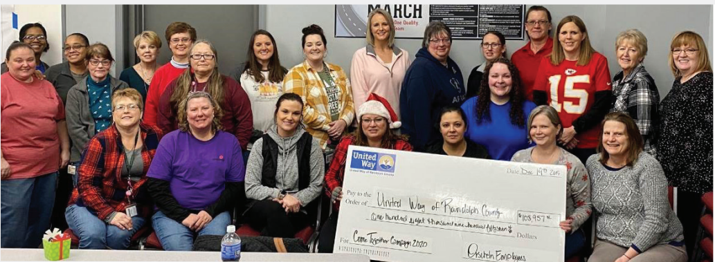
2019 Orscheln United Way Committee

Orscheln employees participate in a 5K run to raise money for the American Cancer Society – Relay for Life, United Way of Randolph County, and the American Diabetes Association. The event raised $475 for each charity.